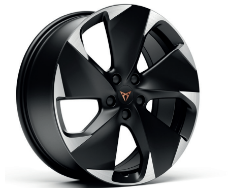
19IN "TYPHOON" MACHINED SPORT BLACK / SILVER (PYB) ■ E-BOOST ↑