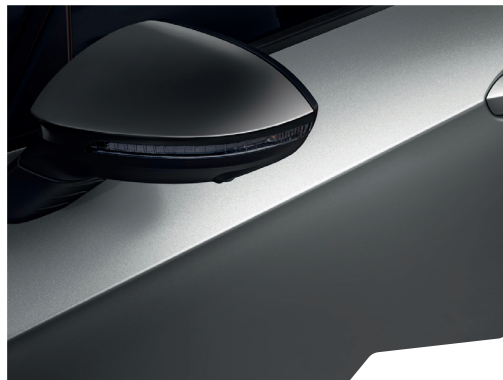
↓ GEYSER SILVER - 1T1T (METALLIC)