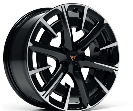
20IN "FIRESTORM" MACHINED AERO GLOSSY BLACK W / PERFORMANCE TYRES (PUZ) ■ ↑