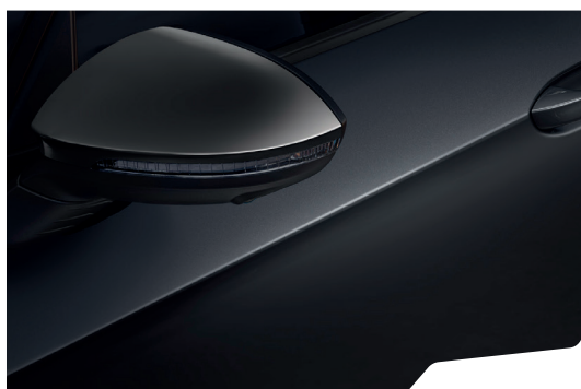
↓ QUASAR GREY - 5V5V (METALLIC)