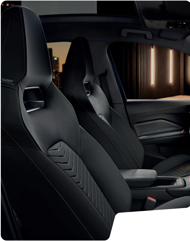
↑ CUPRA BUCKET SEATS WITH SEAQUAL YARN ■ eBOOST (5 seat)