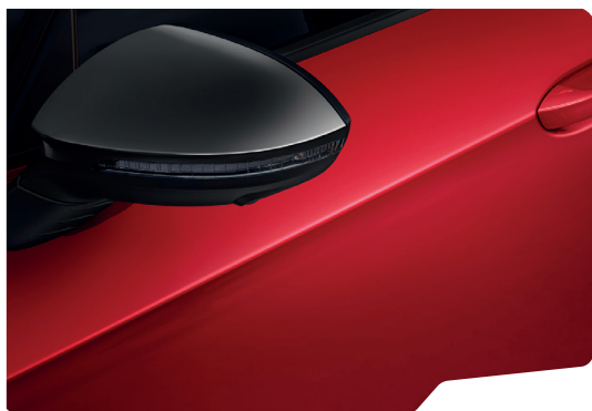
↓ RAYLEIGH RED - P8P8 (METALLIC)