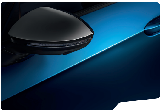
↓ AURORA BLUE - 0F0F (PREMIUM METALLIC)