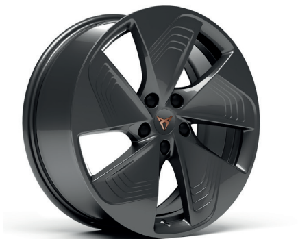
18IN "CYCLONE" ALLOY WHEELS ■ ↑