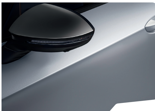
↓ GLACIAL WHITE - 2Y2Y (METALLIC)