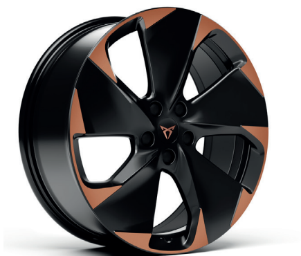
19IN "TYPHOON" MACHINED SPORT BLACK / COPPER (PYA) ■ ↑