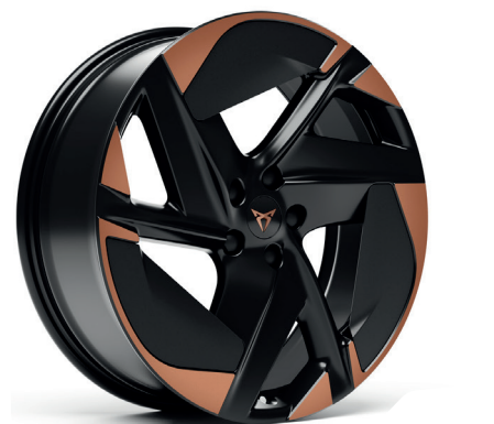
20IN "BLIZZARD" MACHINED AERO GLOSSY BLACK / COPPER (W8Z) ■ ↑