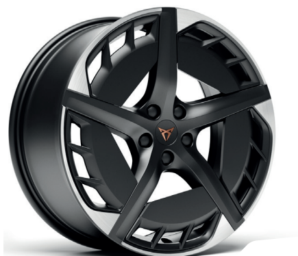
20IN "HURRICANE" MACHINED AERO SPORT BLACK (W8Y) ■ ↑