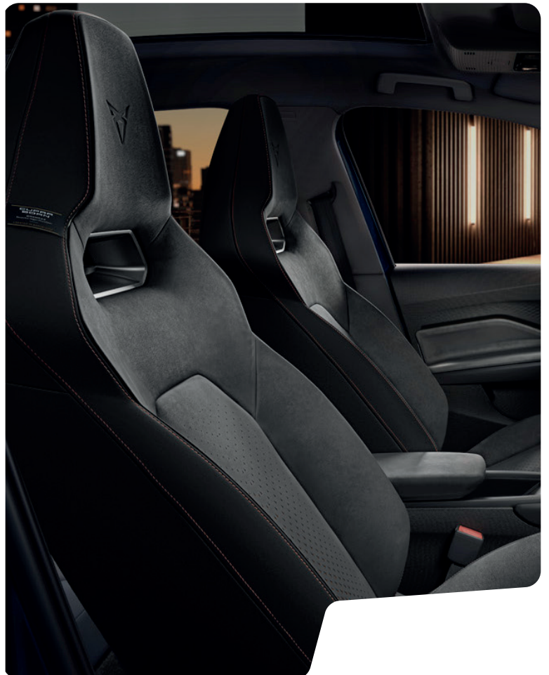
↓ DINAMICA - GRANITE GREY BUCKET SEATS ■ eBOOST (4 seat)