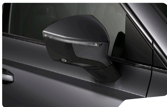
↓ GRAPHITE GREY - 5X5X (Metallic)