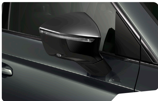
↓ DARK CAMOUFLAGE - 9S9S (Premium Metallic)