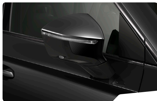
↓ MAGIC BLACK - 1Z1Z (Metallic)