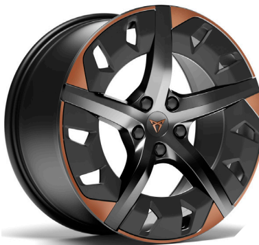
19IN AERO MACHINED SPORT BLACK / COPPER (P9C) ATECA VZ