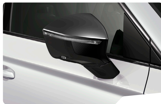
↓ BILA WHITE - 9P9P (Soft)