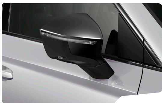
↓ NEVADA WHITE - 2Y2Y (Metallic)