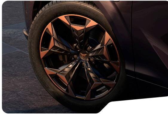
COSMIC COPPER (Z9E) 19" MACHINED SPORT BLACK MATT/COPPER T VZ