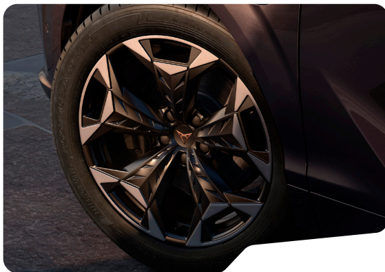
COSMIC (Z9A) 19" MACHINED SPORT BLACK MATT/ SILVER T VZ