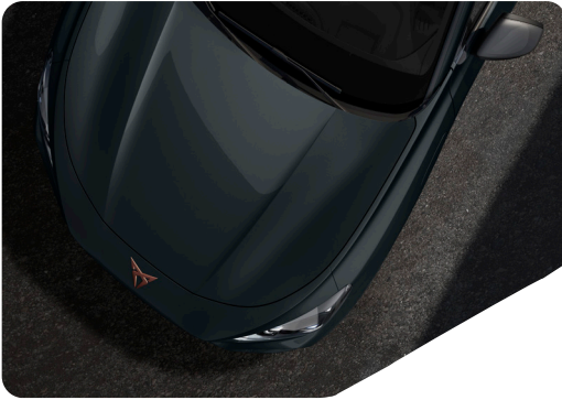
FIORD BLUE - 9K9K (Soft) T VZ