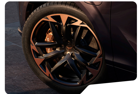
VORTEX** (Z0C) 20" MACHINED SPORT BLACK MATT/ COPPER T VZ