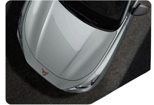
GLACIAL WHITE- 2Y2Y (Metallic) T VZ