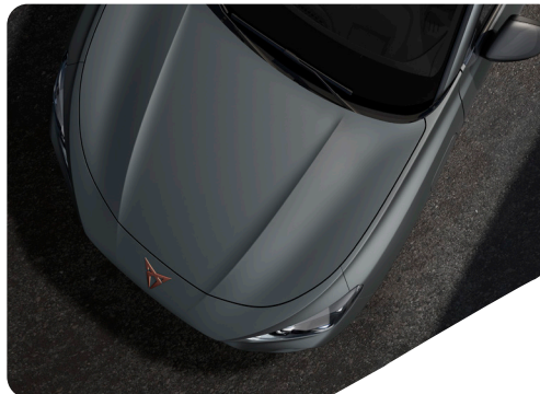
ENCELADUS GREY- Q7Q7 (Matt) VZ (Available from CW20/25)