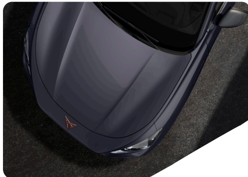
GRAPHENE GREY - R6R6 (Special) T VZ