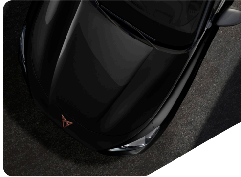
MIDNIGHT BLACK- OE0E (Metallic) T VZ