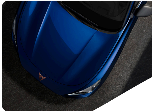
COSMOS BLUE - 2D2D (Metallic) T VZ