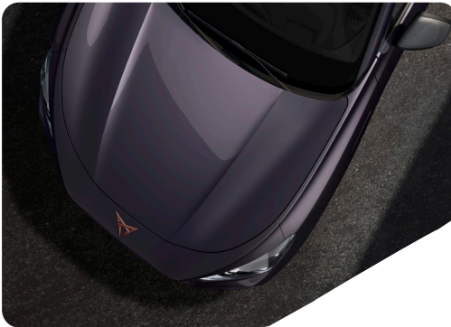
DARK VOID - Q5Q5 (Special Metallic) T VZ