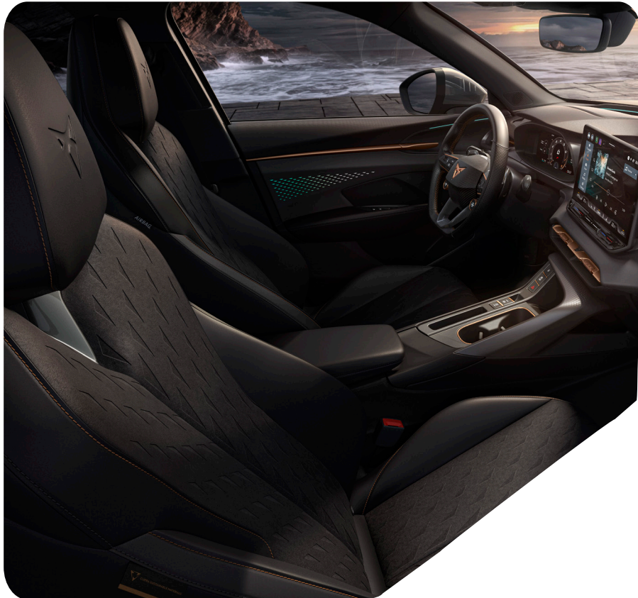
MOON LIGHT DINAMICA SEATS* - YA + PS2 T VZ