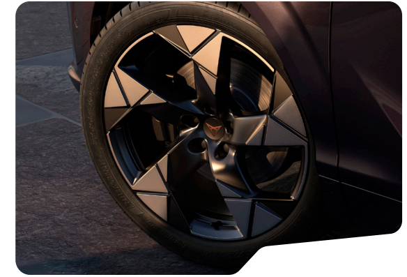
GRAVITY** (Z0B) 20" MACHINED SPORT BLACK MATT/ SILVER T VZ