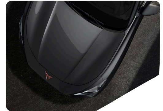
TIMANFAYA GREY - N7N7 (Metallic) T VZ