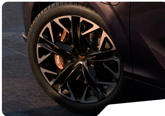
HADRON* (Z0A) 20" MACHINED SPORT BLACK MATT/ SILVER T VZ