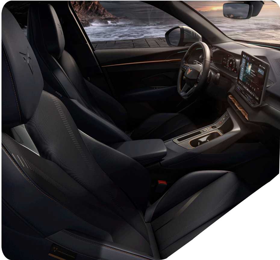
DEEP OCEAN BUCKET SEATS - HM T VZ