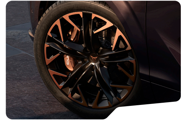
HADRON COPPER* (Z0E) 20" MACHINED SPORT BLACK MATT/ COPPER T VZ