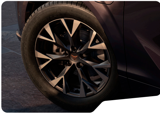
ATOMIC 18" MACHINED SPORT BLACK MATT T