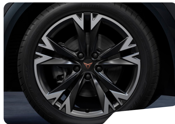
SONORA 18IN MACHINED SPORT BLACK / SILVER V2