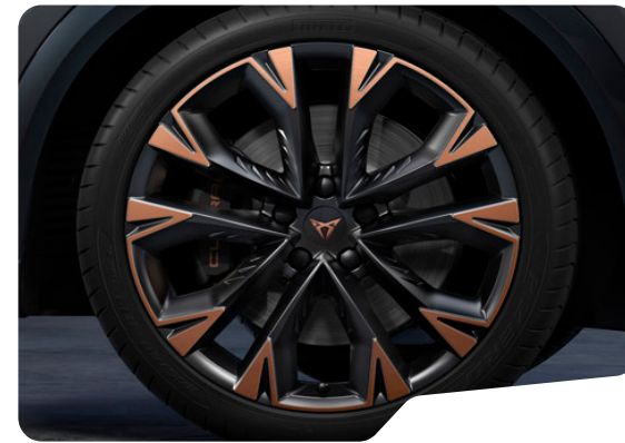
ARTIC COPPER (Z9G) 19IN MACHINED SPORT BLACK / COPPER V2 VZ