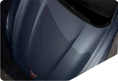
MIDNIGHT BLACK - OE0E