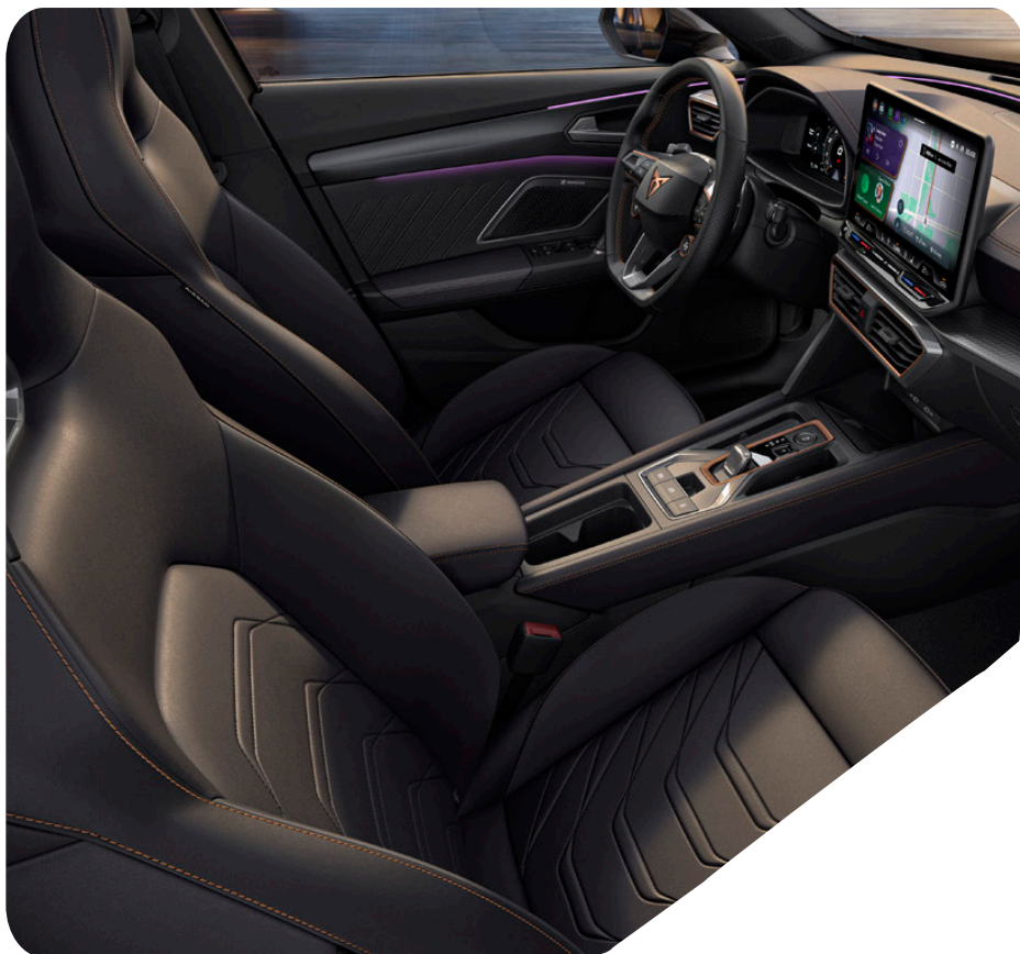
PROGRESSIVE AMBIENT - KE & PR2