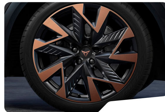
SANDSTORM COPPER (Z9E) 19IN MACHINED SPORT BLACK / COPPER V2 VZ