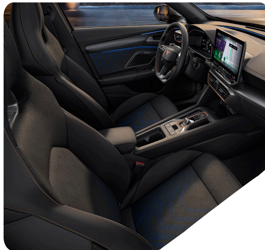
DYNAMIC AMBIENT - CG & PS2 ■ ■