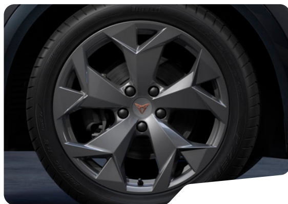
TEMPEST 18IN SILVER ALLOY WHEEL V1