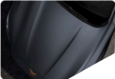
CENTURY BRONZE MATT - L3L3