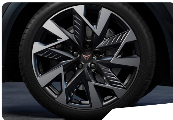
SANDSTORM (Z9A) 19IN MACHINED SPORT BLACK / SILVER V2 VZ