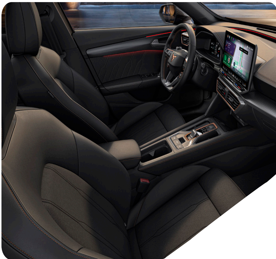
SHARP AMBIENT - AQ ■ ■