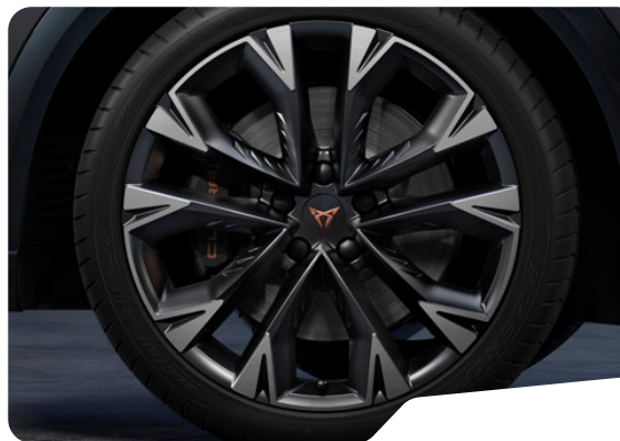
ARTIC (Z9C) 19IN MACHINED SPORT BLACK / SILVER V2 VZ