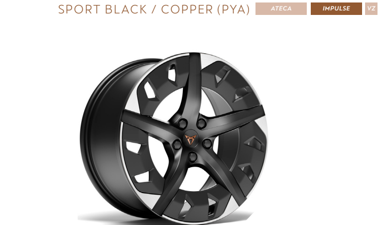
19IN MACHINED R