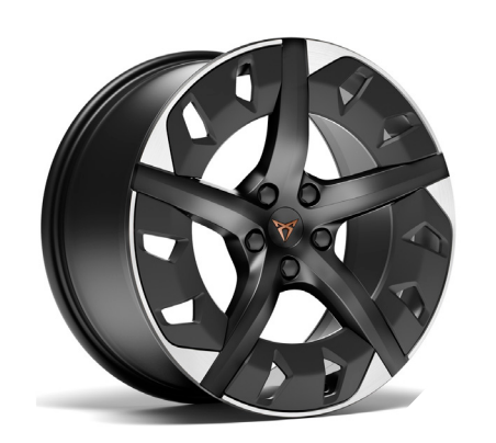
19IN AERO MACHINED SPORT BLACK / SILVER (P8V) ATECA VZ