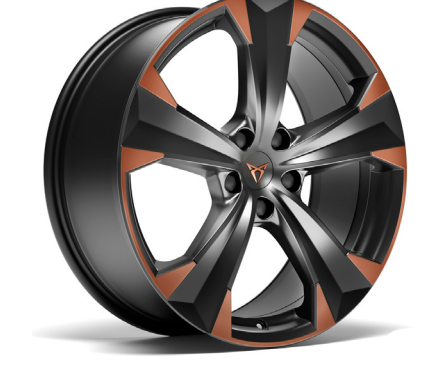
19IN MACHINED SPORT BLACK / COPPER (P8A) ATECA VZ