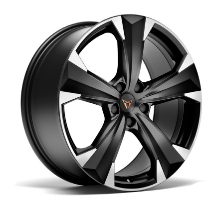
19IN MACHINED SPORT BLACK / SILVER ATECA VZ