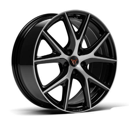
19IN MACHINED R SPORT BLACK / SILVER (PUW) ATECA IMPULSE VZ