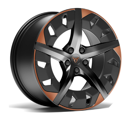
19IN AERO MACHINED SPORT BLACK / COPPER (P9C) ATECA VZ