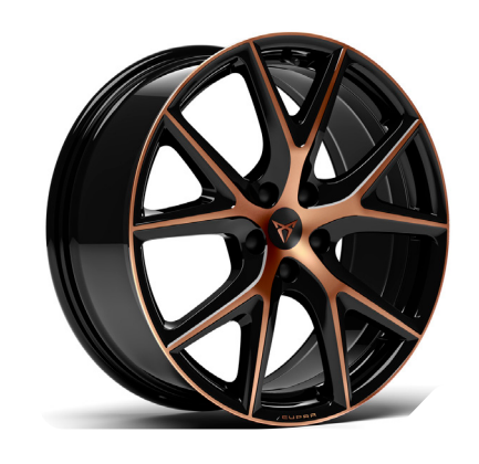
19IN MACHINED R SPORT BLACK / COPPER (PYA) ATECA IMPULSE VZ