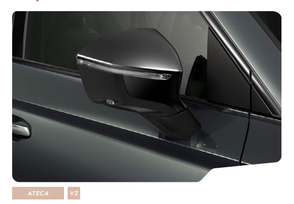
↓ GRAPHITE GREY - 5X5X (Metallic)