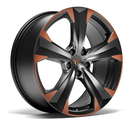
19IN MACHINED SPORT BLACK / COPPER (P8A) ATECA VZ