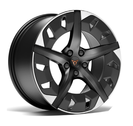
19IN AERO MACHINED SPORT BLACK / SILVER (P8V) ATECA VZ