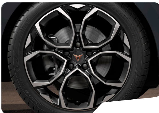
WINDSTORM (R8A) 18IN MACHINED SPORT BLACK / SILVER V2