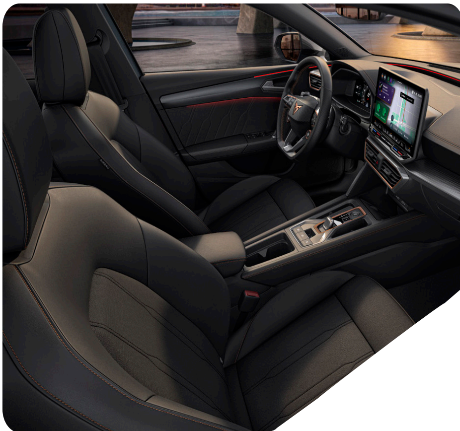
SHARP AMBIENT - AQ V1 V2