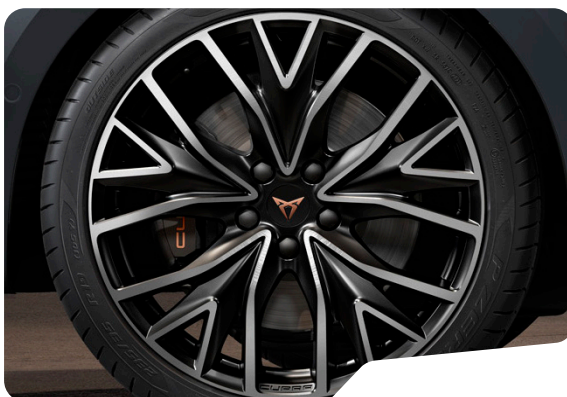
MISTRAL (R9C/PD3) 19IN MACHINED SPORT BLACK / SILVER V2 V2