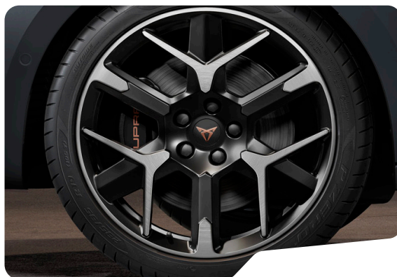
HAILSTORM (R9I) 19IN FORGED MACHINED SPORT BLACK / SILVER V2