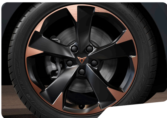
GARBI COPPER (R8E) 18IN MACHINED COPPER V2