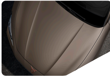
CENTURY BRONZE MATT - L3L3 VZ