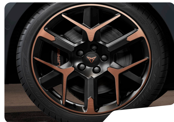
HAILSTORM COPPER (R9M) 19IN FORGED MACHINED SPORT BLACK / COPPER V2