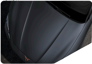
MAGNETIC TECH MATT - 9R9R V1 V2 VZ