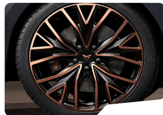
MISTRAL COPPER (R9G/PD4) 19IN MACHINED SPORT BLACK / COPPER V2 V2