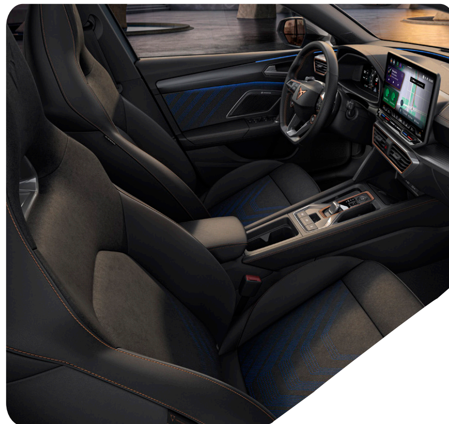
DYNAMIC AMBIENT* - CG + PS2 V2 VZ