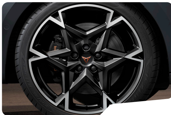
POLAR (R8E/PD1) 19IN MACHINED SPORT BLACK / SILVER V2 V2