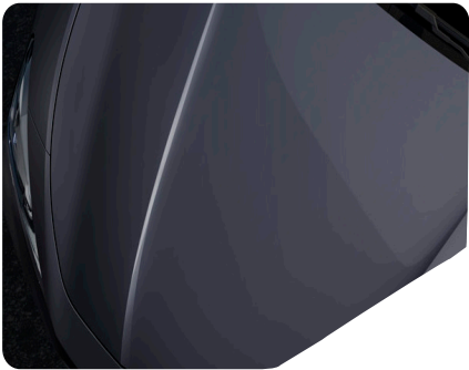
TAIGA GREY - 4U4U V1 V2 VZ