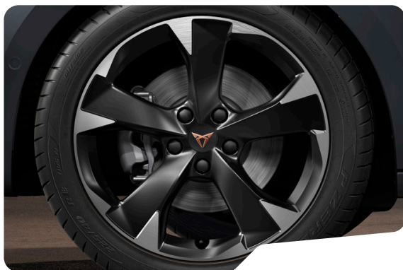
GARBI 18IN MACHINED SPORT BLACK / SILVER V1