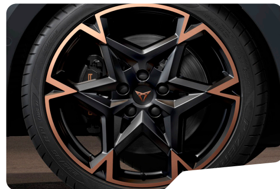
POLAR COPPER (R9E/PD2) 19IN MACHINED SPORT BLACK / COPPER V2 V2