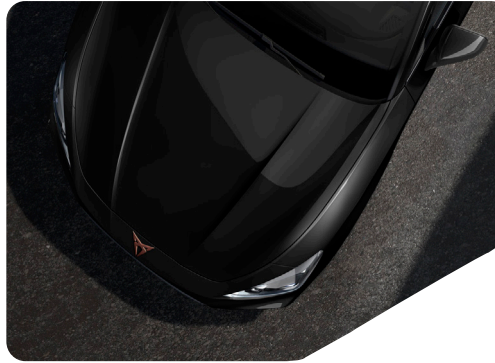
MIDNIGHT BLACK- OE0E (Metallic) L VZ