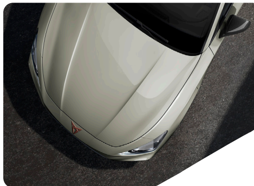
TAIGA GREY- 4U4U (Special) L VZ