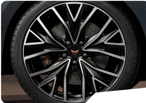
MISTRAL 19IN MACHINED SPORT BLACK / SILVER L VZ