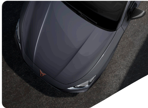
GRAPHENE GREY - R6R6 (Special) L VZ