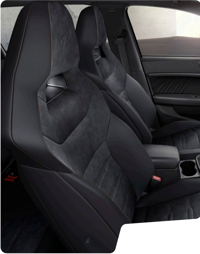
↑ BLACK ALCANTARA INTERIOR